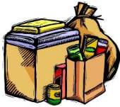
Food Pantry Donations Needed